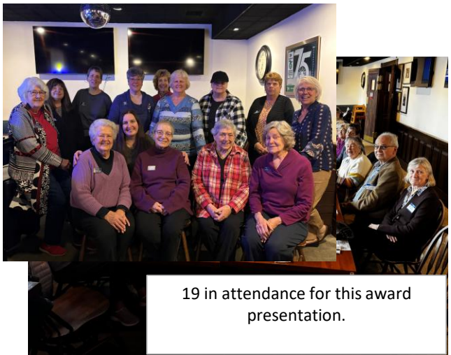
19 in attendance for this award presentation.