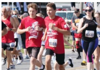
Tunnel to Towers 5K 5K RUN/WALK July 5 • North Conway NH