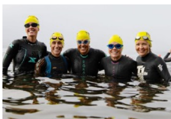
Live Free & Tri TRIATHLON, DUATHLON, AQUABIKE May 31 • Freedom NH

Volunteer and Fundraise This is a great opportunity to include your families and support Altrusa. For each Altrusa volunteer TriTek donates. Details are on their Webpage, the link is below. You are required to download and complete the volunteer form.. before the event. Contact information is below.