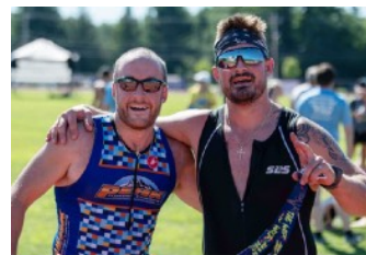
Wolf Triathlon TRIATHLON, DUATHLON, AQUABIKE August 2 • Wolfeboro NH