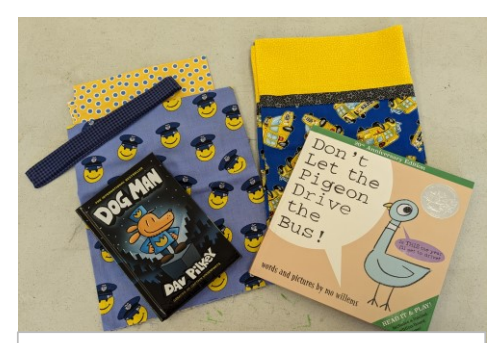
Pillowcase fabric matched to books

February 10 - Altrusans with Cricket Comforts members matching books to pillowcases.