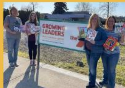
Altrusa International of Albany OR donated 80 new books to Growing Leaders Early Learning Center to support literacy among its community.