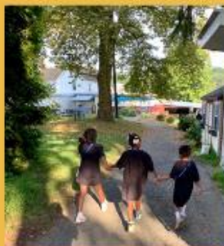
Young campers taking a stroll at Camp Dreamcatchers, a 2022 Club 21 grant recipient.

The Foundation distributed a grand total of $414,430 in giving programs, scholarships, and awards.