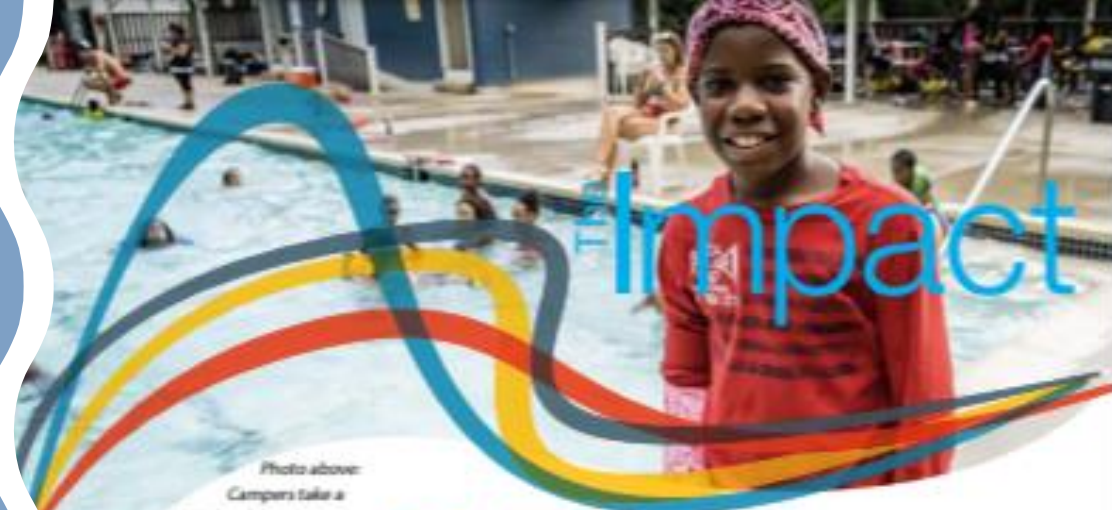
Photo above: Campers take a break while working on their physical goals at Camp Dreamcatcher in Kennett Square, Pennsylvania.

Have you seen THE IMPACT, the Foundation's quarterly newsletter?